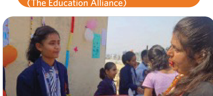
During school level showcases, students put up caricature stalls, face painting stalls, games stalls, and a "come paint with us" stall (Slam Out Loud)