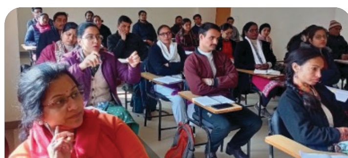
AASRA educators participated in SEE Learning workshops