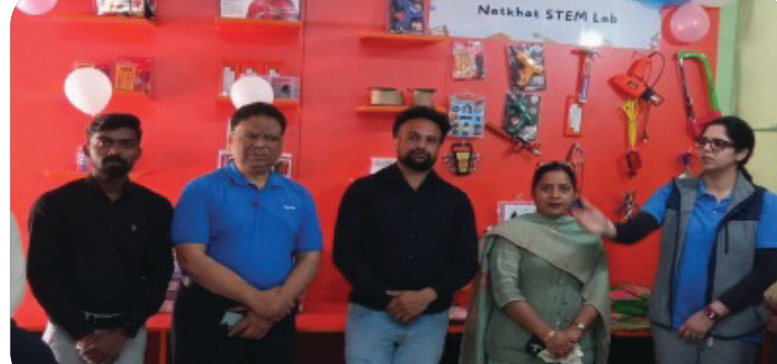
Natkhat stem lab set-up in Punjab government school