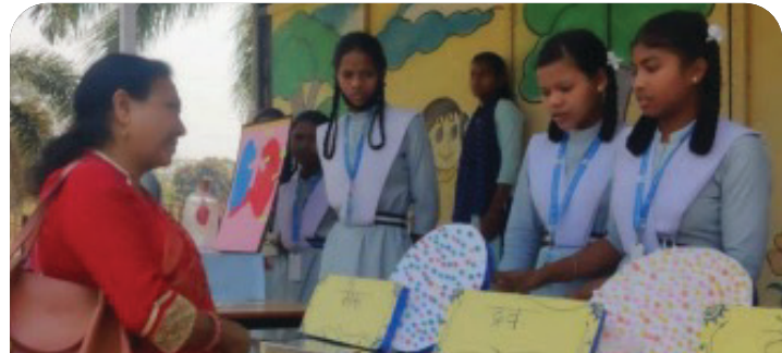
Science day celebrations in government schools in Chhattisgarh (Shiksharth Trust)

Student-led showcases are often characterized by a spirit of innovation and experimentation. Free from the constraints of commercial pressures or curation expectations, our partners Shiksharth, The Education Alliance, Kshamtalaya Foundation, Slam Out Loud encouraged the students to push the boundaries of their creativity. Students experienced skills like organisation, collaboration, creativity in the process of planning and executing the showcase.