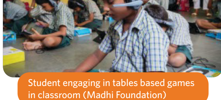
Student engaging in tables based games in classroom (Madhi Foundation)