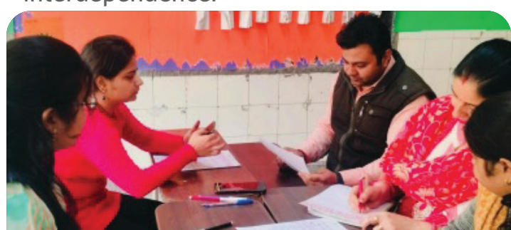
Teachers expressing gratitude during "Teachers Cafe" (Kshamtalaya Foundation)

Our partners Kshamtalaya Foundation and AASRA Trust conducted integrated SEE Learning sessions this quarter. Teachers were introduced to a transformative Wellbeing Program aimed at cultivating essential skills such as self-awareness, emotional reappraisal, and interdependence.