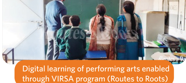
Digital learning of performing arts enabled through VIRSA program (Routes to Roots)

Digital learning technologies enable learning beyond boundaries which is accessible, flexible, interactive and personalized. Our NGO partners Routes 2 Roots and Madhi Foundation enabled digital learning platforms for students and facilitated life-long learning and continuous skill development.