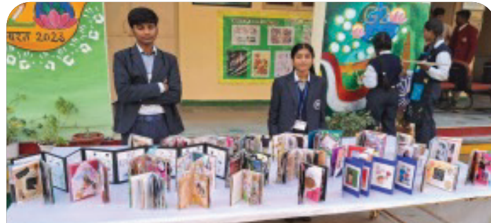
Student led art exhibitions by students of Schools of Special Excellence in Delhi (The Education Alliance)